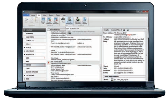
XRY Watch List feature

Know in advance what you can and cannot recover. One of the great advantages of doing things properly is that we provide a help file for every single device we support. This searchable index document provides detailed information on precisely what you can and cannot recover from each device.